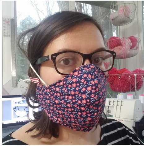
*Photo has a n95 mask underneath BaLa N95 Mask Fabric Cover

Recommended Pattern for Sewing Masks for Atlanta Hospitals (COVID-19)